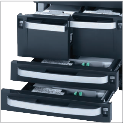
STANDARD PAPER CAPACITY up to 4,100 sheets