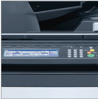
8" BROAD TOUCH-SCREEN with 640 x 240 dpi resolution