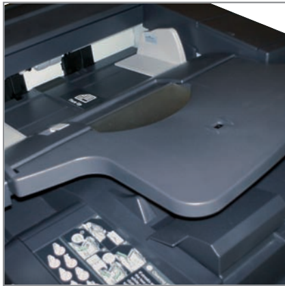
HIGH-SPEED DUPLEX SCANNING