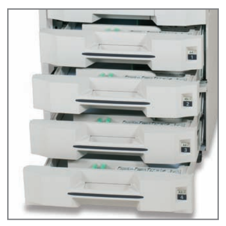
4 UNIVERSAL CASSETTES for a maximum paper capacity of 2,200 sheets