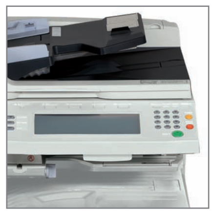
ADJUSTABLE TOUCH-SCREEN PANEL with intuitive menu