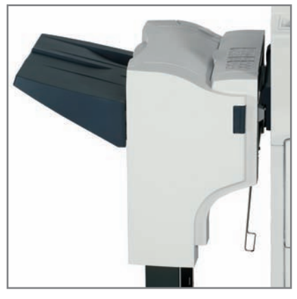
DF-730 FINISHER with a 1,000-sheet output capacity tray