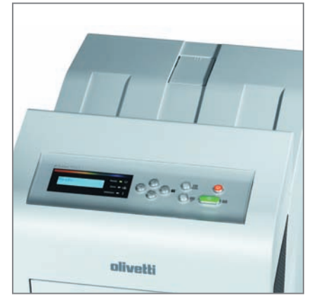
DUPLEX with front access to eliminate paper jams

Management of print operations can be optimised with memory expansions up to 1,280 MB and installation of an optional 40 GB hard disk (for the P226).