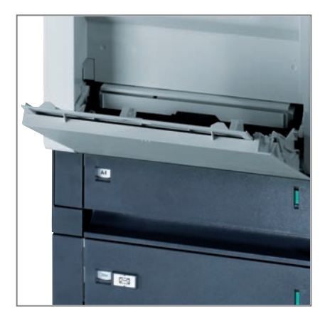
MULTI-PURPOSE PAPER TRAY for 150 cut sheets