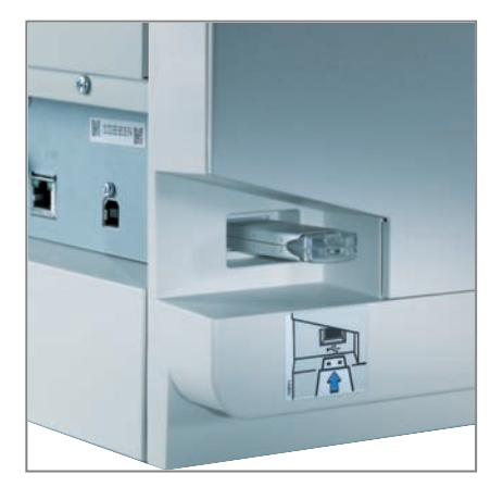
PRACTICAL USB PORT for direct printing from flash drives